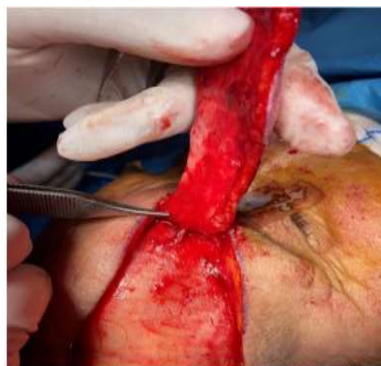
Figure 3: The flap is elevated in full thickness, after excision of the hemi tip and alar wing

After complete excision of the nasal subunits requiring reconstruction, a full-thickness forehead flap, including the frontalis muscle, is elevated. The flap should be rotated toward the nasal side to facilitate movement and reduce tension on the eyebrow. Deep plane reconstruction begins with folding and suturing the distal portion of the flap using absorbable sutures. The flap is then inset into the recipient site (nasal tip and nostril wing). The forehead donor site is closed with careful undermining. To minimize secretions and bleeding while improving patient comfort, the deep aspect of the pedicle may be skin-grafted. At the end of the first stage, the flap remains thick. Excess frontalis muscle is excised in the second stage to refine nasal contours.